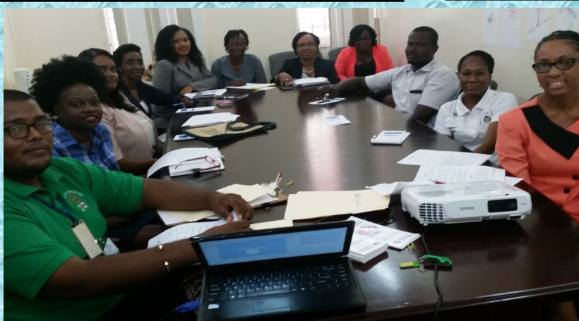
Participants of Child Care & Protection Agency Sensitization on July 18th, 2017