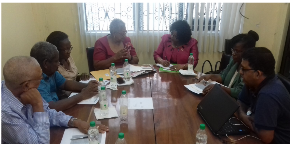
Hon. Minister Volda Lawrence (third from right), NCD's Chairperson Evelyn Hamilton & other representatives on June 6th, 2017

Commissioners of the National Commission on Disability (NCD) met with the Hon. Minister of Public Health Volda Lawrence on July 6th, 2017 at NCD's Secretariat 49 Croal Street, Georgetown.