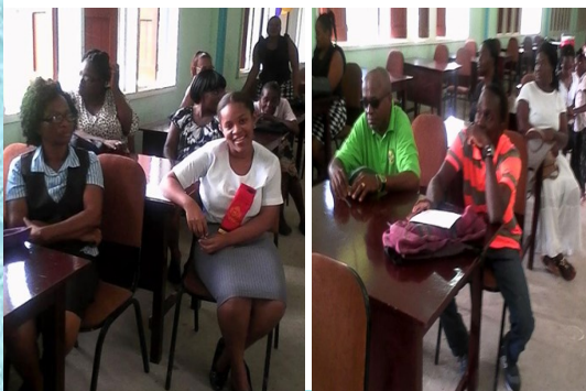
Some participants at the Seminar