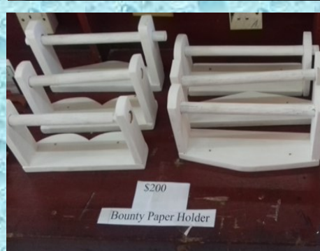
Paper towel Holder