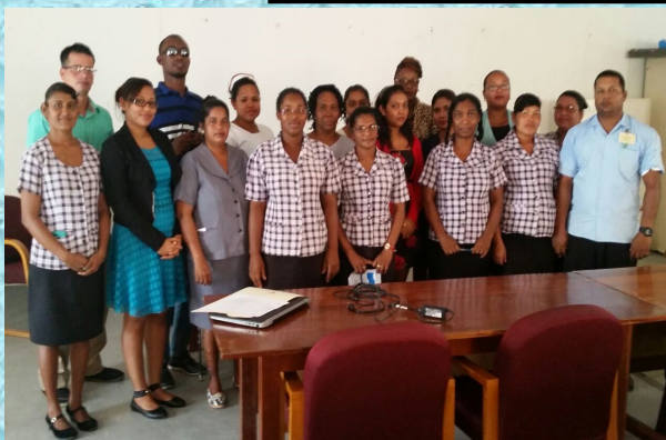
Participants of Suddie Hospital on June 27th, 2017